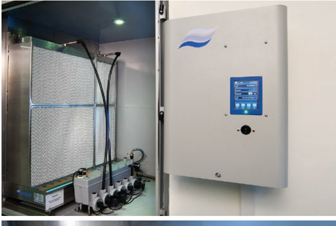
ME-Series Media Evaporative cooling and humidification

modular data centers, Nortec has the technology and expertise to provide the ideal solution.